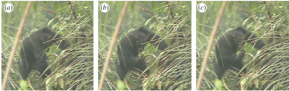
Figure 2. Adult male chimpanzee (FF) uses a leaf tool to drink raffia sap from a container (see also electronic supplementary material, video S1): (a) FF inserts right hand holding the leaf tool into the fermented palm sap container, (b) retrieves the leaf tool that is soaked in fermented palm sap and (c) transfers the soaked leaf tool to his mouth to drink the palm sap it carries (photos by M. Nakamura, 28 December 1996, see electronic supplementary material, table S2, session 2).