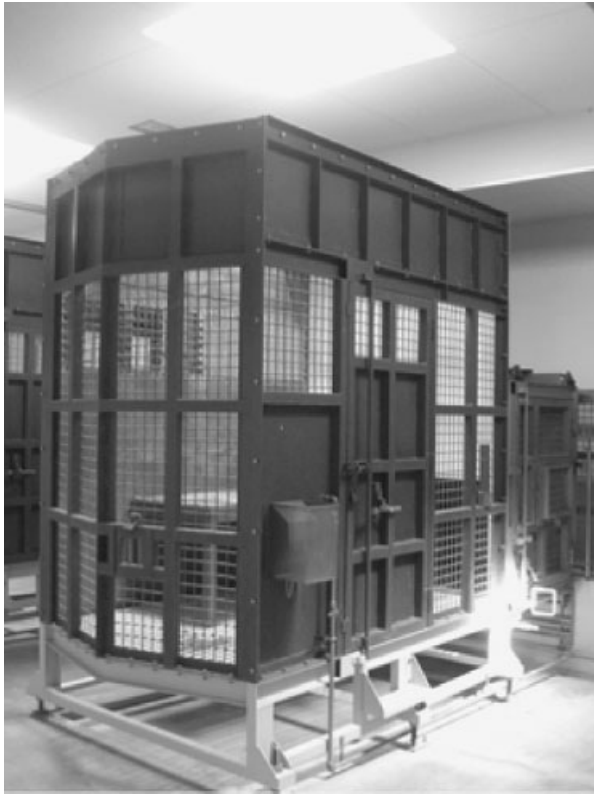
Fig. 2. Individual cage built by Sanwa for biomedical studies in 2000.

of strong welfare standards and environmental enrichment began. CSU also initiated a relocation program to move chimpanzees to zoos throughout Japan.