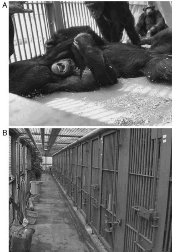
Fig. 4. Chimpanzees in an all-male group of eight individuals sometimes play with others (photo A). Several individual rooms that had been isolated were connected to form their new residence (photo B). Fission–fusion emulation, a routine group formation by repeated separation and unification of group members, was introduced first for their aggression control at CSU.

The Primate Research Institute of Kyoto University founded a new independent research