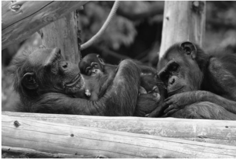
Fig. 6. Photograph taken in the destination zoo in the relocation program. Koyuki, a nulliparous female, carefully watches a twin on the belly of Sango, ex-CSU chimpanzee mother. It was the first experience for Koyuki and other females to interact with baby chimpanzees.

should be a minimum of five individuals and should comprise multiple males and multiple females if conditions permit. Group formation had begun at CSU before the relocation at a destination zoo. We also have found that it is stressful for the chimpanzees to form social groups with unfamiliar individuals in a novel place, especially with unfamiliar caretakers. To reduce such stress, zoo caretakers and veterinarians participate in new group formation at CSU. In addition, visits to CSU by caretakers from the destination zoos provided opportunities for interactions between future caregivers and chimpanzees. A similar procedure was used when chimpanzees are transferred from a zoo to CSU. In July 2007, two adult chimpanzee males—Kenny and Toon—came to CSU. For the first 6 months after their introduction, CSU chimpanzees acted aggressively toward the new males, although over time they were successfully accepted into the group.