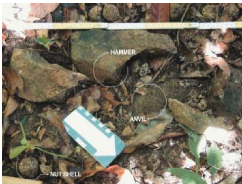
Fig. 2. The SB 6 site in the Kourouhan area (Mont Medou). Large quartz hammers to open crack the Panda nuts were found on the top of the outcropping anvil. Refitting of stones was also detected.