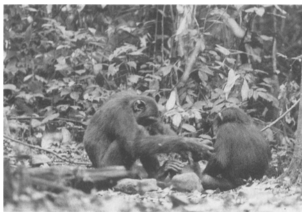
Fig. 2. An adolescent male chimpanzee, FF (left), cracking a nut on an anvil stone holding a hammer stone in his right hand. A juvenile chimpanzee (right) is observing him.

The chimpanzee usually hit the nut repeatedly until it opened. Occasionally, he/she stopped or went away before cracking was achieved when other chimpanzees began to travel or there was some kind of disruption. Young chimpanzees often stopped hitting because of difficulty with cracking. If less-skillful hitting caused the nut to spring from the anvil, the chimpanzee picked it up and placed it again on the anvil using the same hand, while the other hand continued to hold the hammer. When cracking was completed, the chimpanzee took the kernel from the broken shell to eat, swept the surface of the anvil with the back of his/her hand that was not used for holding the hammer, and picked up another nut to be placed on the anvil. He/she then began hitting again. Further details of the nut-