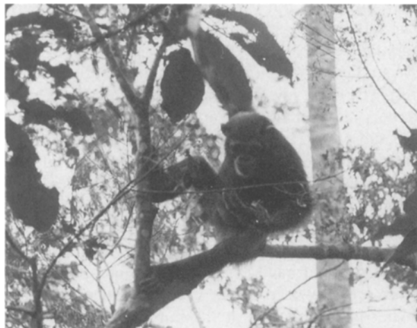
Fig. 1. A young female chimpanzee, Yu , picking a small fruit from a branch with her left hand and supporting her body with her right hand.

Food picking: The first measure was food-picking behavior, i.e. picking a food (fruit, young leaf, or some other material) from a branch and taking it into the mouth (Fig. 1). When